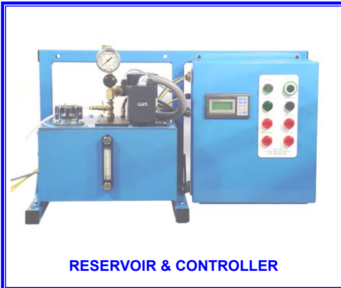
RESERVOIR & CONTROLLER