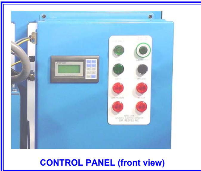
CONTROL PANEL (front view)