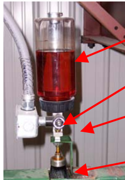
Photo of installed brush lubricator

Lubricant drips into brush that smears it on conveyor chain and wheels